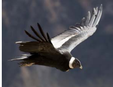
Colca Canyon Casitas del Colca 5 Nights