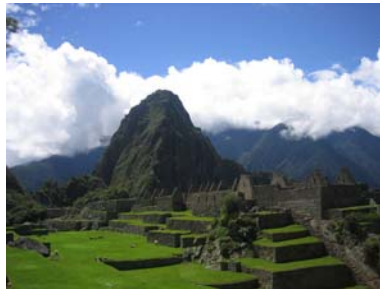
Sacred Valley & Machu Picchu Tambo del Inka 5 Nights