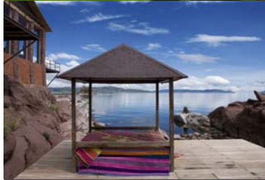
Lake Titicaca Titilaka 5 Nights