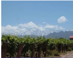
Mendoza Luxury Hotel 4 Nights