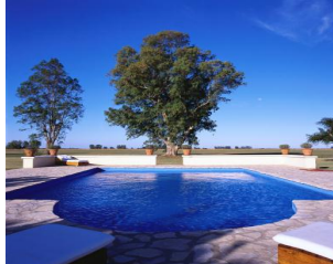
Pampas Luxury Estancia 4 Nights