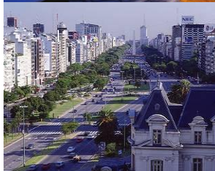
Buenos Aires Luxury Boutique Hotel 4 Nights